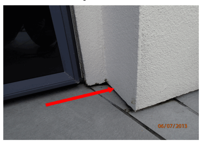
29) COATING FINDINGS

Mould and lichen are growing on beveled sill surface. Persistent growing of lichen on cladding surface may degradate the coating and cause premature coating failure. Ensure regular washing and cleaning to wall cladding with well teste