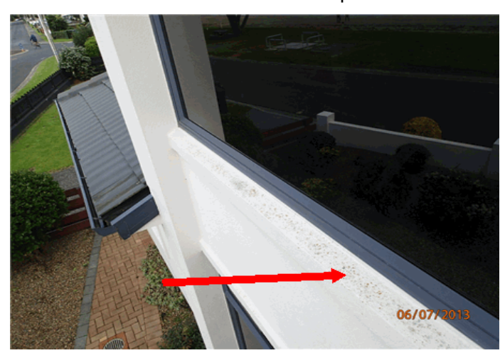
30) FIXINGS FINDINGS

Mould and lichen are growing on beveled sill surface. Persistent growing of lichen on cladding surface may degradate the coating and cause premature coating failure. Ensure regular washing and cleaning to wall cladding with well tested and proofed cleaning product.