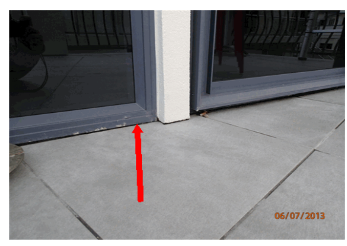
64) VISIBLE FLOOR BASE LEAKING

Door sill to balcony floor clearance insufficient. Lack of sufficient sill clearance may result with leaks by splashing and wikcing.